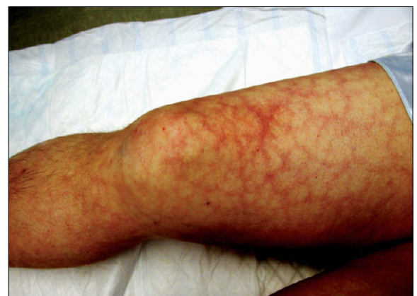
Figure 2: Livedo reticularis in a woman with antiphospholipid syndrome

In 1998, the preliminary classification criteria for antiphospholipid syndrome were proposed at Sapporo,