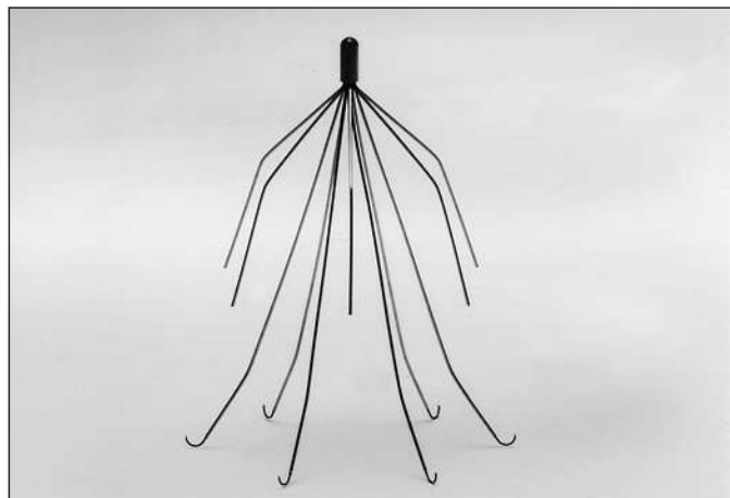
Figure 2: Recovery vena cava filter.

The Recovery Filter (Bard Peripheral Vascular, Tempe, AZ) was the first filter to be given 510K clearance for removal (July 2003) although it had received European CE clearance in 1999. The Recovery Filter (Fig. 2) is designed to allow retrieval even after incorporation into the wall of the IVC. This filter is a two level filtration system composed of Nitinol (mixture of nickel and titanium) delivered via a 7 Fr introducer, a dilator and a pusher. The six legs end in elastic anchoring hooks. When pressure is applied to pull the filter out, the hooks straighten so that the legs slide out of the neointimal sleeves that have formed during implantation. The filter requires the use of the Recovery Cone inserted percutaneously which consists of nine struts bearing a urethane membrane that forms a cone around the filter and withdraws it into the sheath for retrieval (Fig. 2). Efficacy and safety of the Recovery Filter were evaluated in a preliminary study of 32 patients (27). Patients had to meet the following inclusion criteria: indication for filter placement (recent PE, recent DVT, or prophylaxis), anticipated return to anticoagulation therapy 10